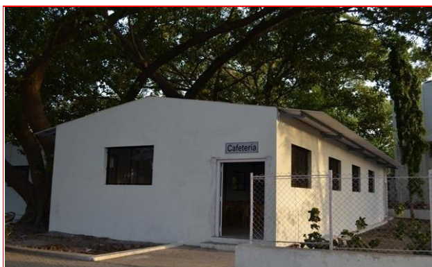
Cafeteria (154 sq.m.)

Auditorium/Seminar Halls/Amphitheatre: Available, Seminar hall