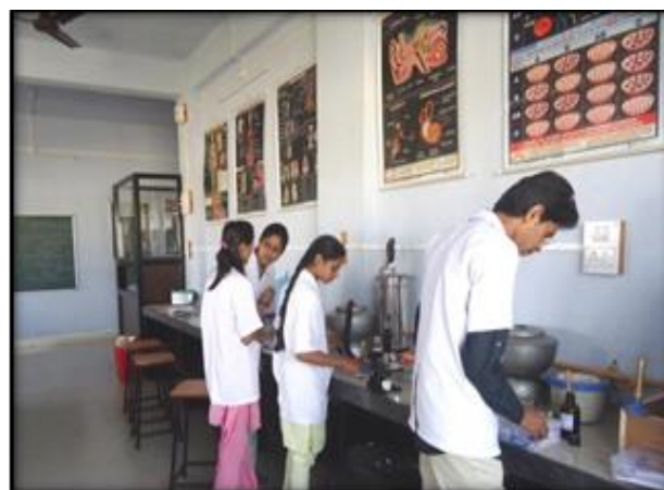
Human Anatomy & Physiology Lab.