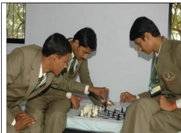
Student Playing Chess

Indoor Sports facility: Available (Table tennis table, Badminton, Carom, Chess)