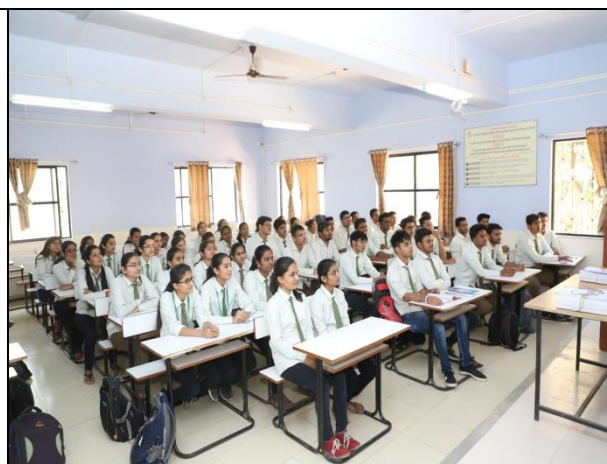
Seminar Hall (132 sq. m.)

Indoor Sports facility: Available (Table tennis table, Badminton, Carom, Chess)