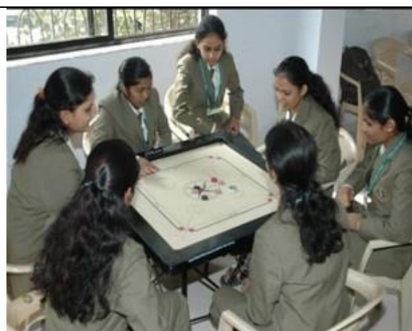
Student Playing Carrom