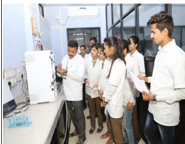
Central Instrument Lab